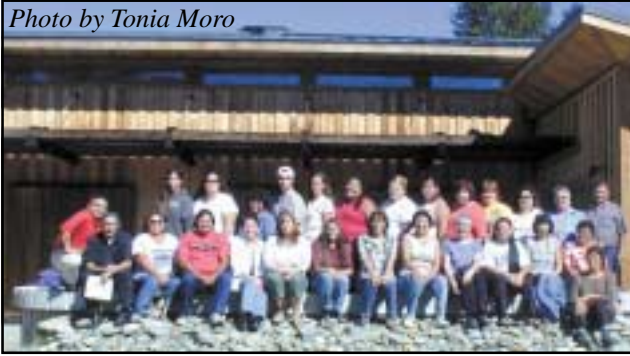
Participants in the Karuk/Smithsonian Museum Training Workshop, September 2003, Happy Camp, California

Museum Training: September was a very busy month for the People's Center. From September ninth to the eleventh, the Karuk Tribe of California hosted a Museum Training Workshop for Tribal museums in partnership with the Smithsonian Institution's National Museum of the American Indian. The workshop focused on museum basics and covered a broad range of topics from starting a museum to collections