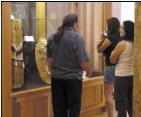
Tribal Reunion visitors viewing display at the People's Center