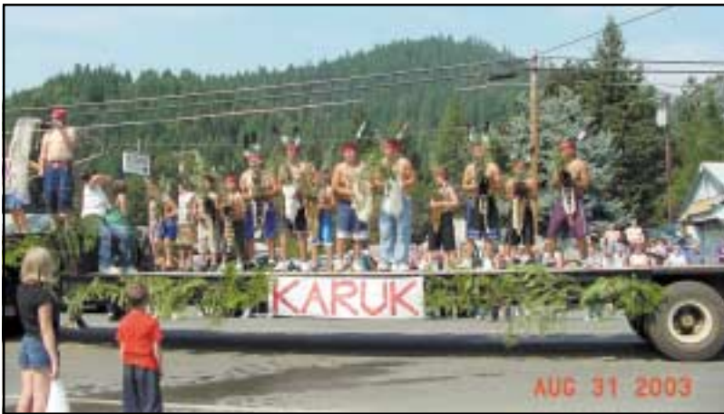
Tribal members and descendants danced for judges and parade onlookers at the Bigfoot Jamboree Parade in Happy Camp on Labor Day Weekend.