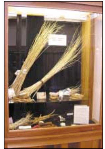
Basket making materials on display at the People's Center

The majority of respondents were satisfied with the Tribal Newsletter, but would like to have additional materials; i.e., Council minutes, stories from the elders, letters to the editor (comment/complaints), and more information.